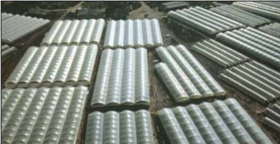
Master rolls are chosen from a huge stock according to each customer's specification...

"Film is film, just buy the cheapest", is a comment heard too often these days. No film is a bargain if it doesn't show up on time.