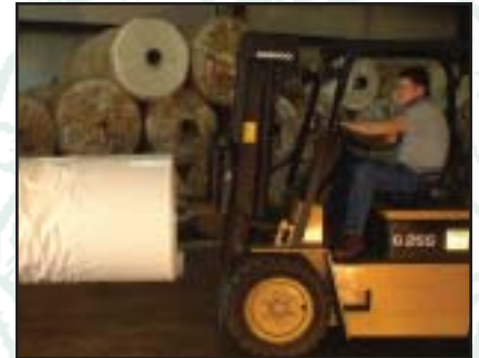
Loading onto one of Green.Tek's many rewinders...

Excellent products and unheard of service – and that's what everyone expects from Green.tek – and that's how Green.tek has grown to be a leader in the Greenhouse Coverings industry.