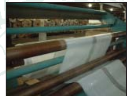
Measure to custom length...